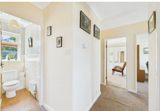
Bathroom 6'6" x 8'1" (1.99m x 2.47m)