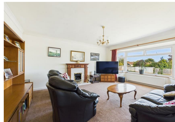
Dining Room/Sitting Room 10'4" x 16'8" (3.16m x 5.10m)